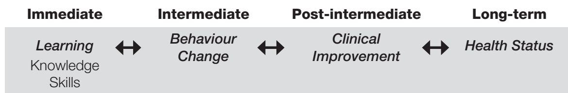
Table 1: The AADE continuum of diabetes education outcomes.

The AADE identifies learning of knowledge and skills by the person with diabetes as the immediate outcome of diabetes education and a pre-requisite for the adoption of self care behaviours (behaviour change). Behaviour impacts on, but is not the only determinant of, clinical improvement. Improvement of health status is identified as the ultimate outcome to which diabetes education contributes.