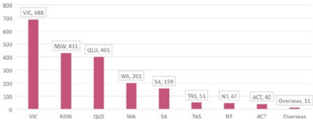
Figure 2 - ADEA membership by branches and overseas

Currently Victoria (33%), New South Wales (21%) and Queensland (20%) represent the majority of our membership with Western Australia (9%) and South Australia (7%) being next in progression. The remainder, 10%, are distributed in Tasmania (3%), the Northern Territory (2%), the Australian Capital Territory (2%) and 11 members are currently living overseas.